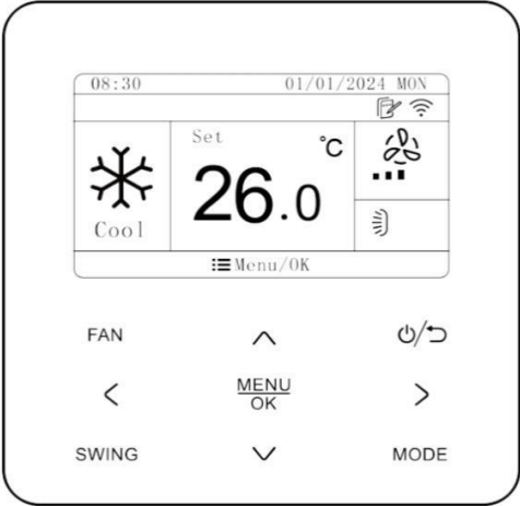
Outline of wired controller

Optional wired controller for GMV units. 7-day programmable function, up to 4 weekly programmable schedules simultaneously.