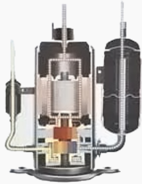
GREE'S LOAD MATCH VARIABLE SPEED COMPRESSOR