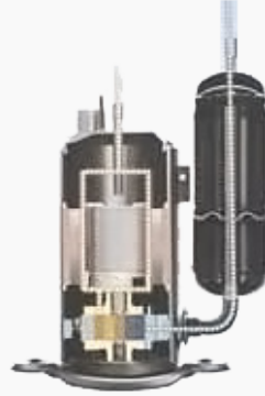
TRADITIONAL SINGLE SPEED COMPRESSOR